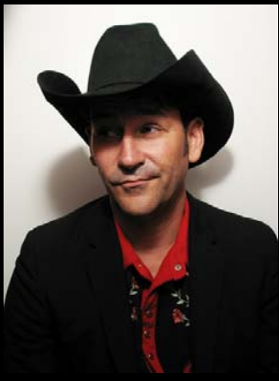
THURSDAY March 18 (5-8pm): Buttercup (Pop Performance)